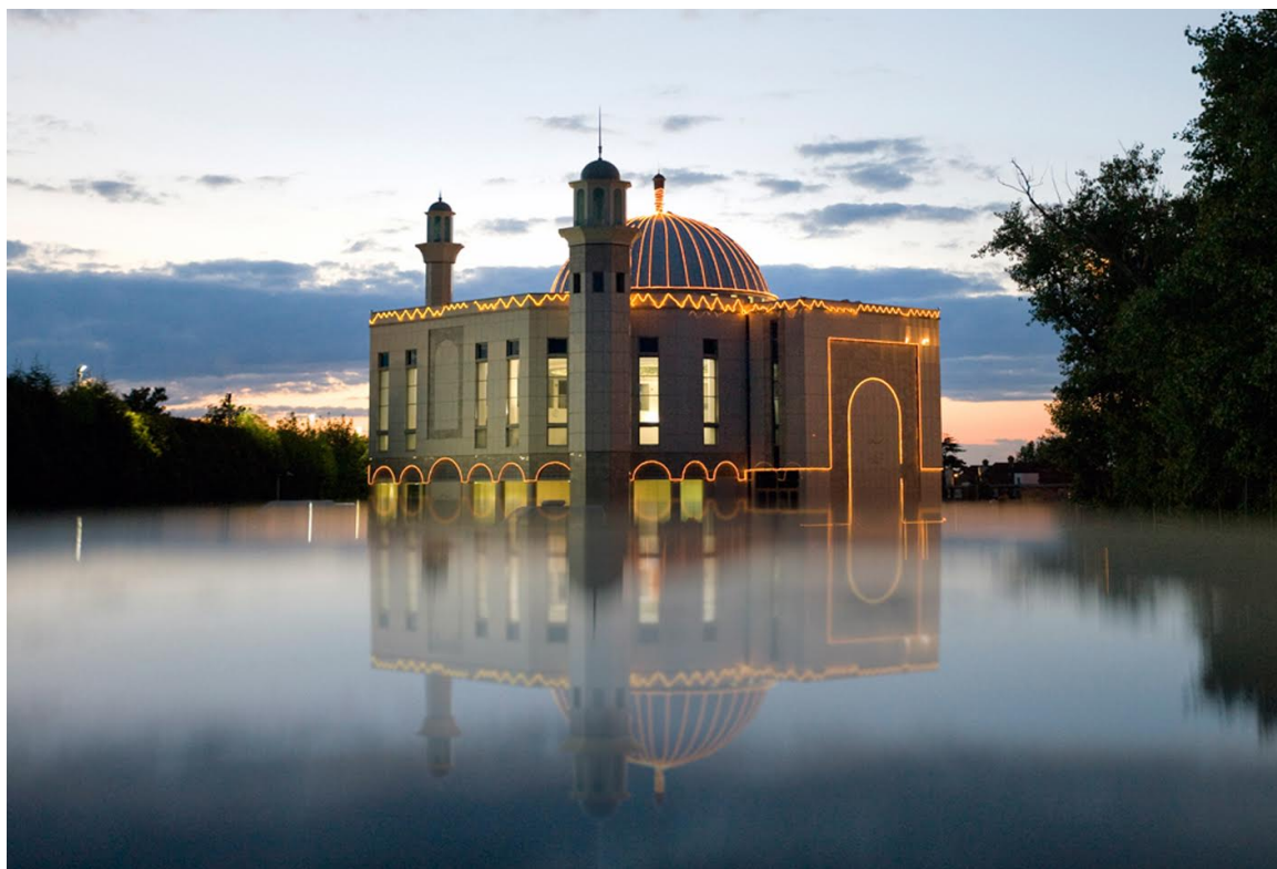
The 12 th National Peace Symposium was held at the Baitul Futuh Mosque, London. It is the largest mosque complex in Western Europe.

Rather, this permission for a defensive war was granted to protect the religious freedom of all people. In Chapter 22, Verses 40-41 of the Holy Quran, Allah the Almighty said that if the Muslims did not defend themselves at that stage then no church, synagogue, temple, mosque or any other place of worship would remain safe. Therefore, where Islam gave permission for a defensive war, it was granted in