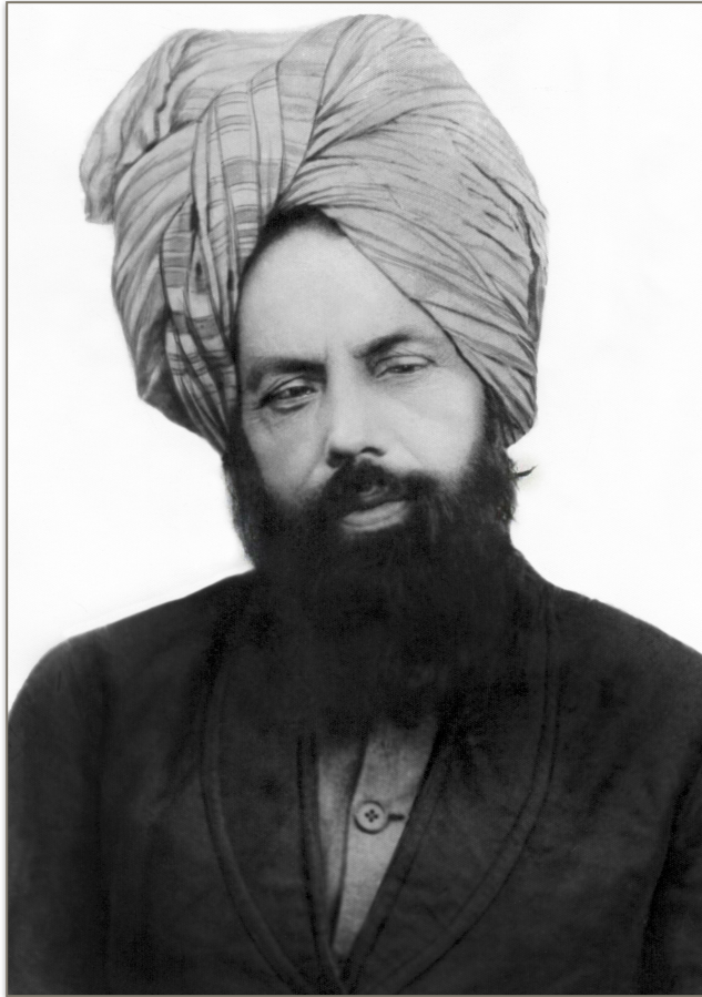
HAZRAT MIRZA GHULAM AHMAD QADIANI THE PROMISED MESSIAH عليه الصلوة والسلام

The Ahmadiyya Muslim Community was founded in 1889 by Hazrat Mirza Ghulam Ahmad as (1835-1908) of Qadian, India. He claimed to be the expected reformer of the latter days and the awaited one of the world's religions (the Messiah and Mahdi of the latter days). His mission was to revive the peaceful teachings of Islam and engender in people's hearts the love of God and the duty to serve mankind.